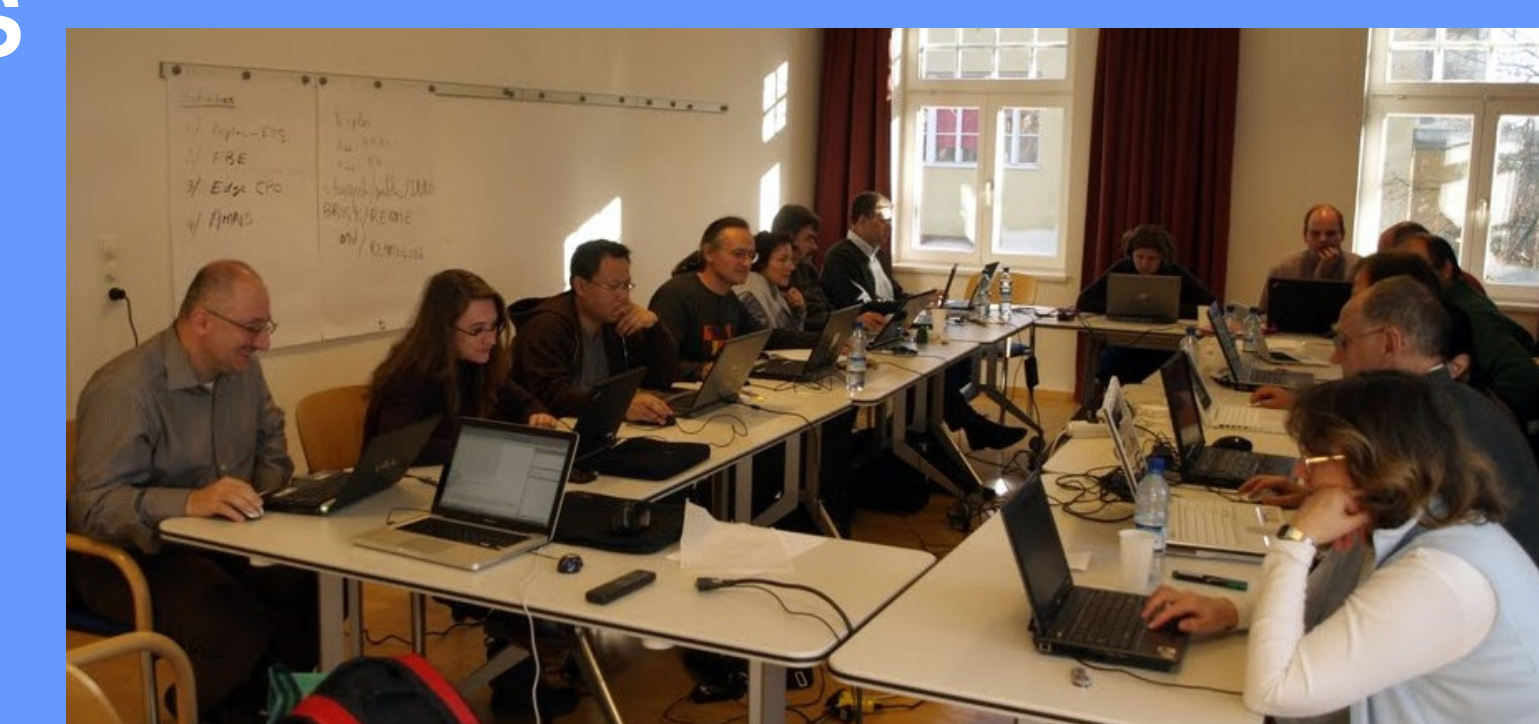
Innsbruck, AOW Dec. 2010