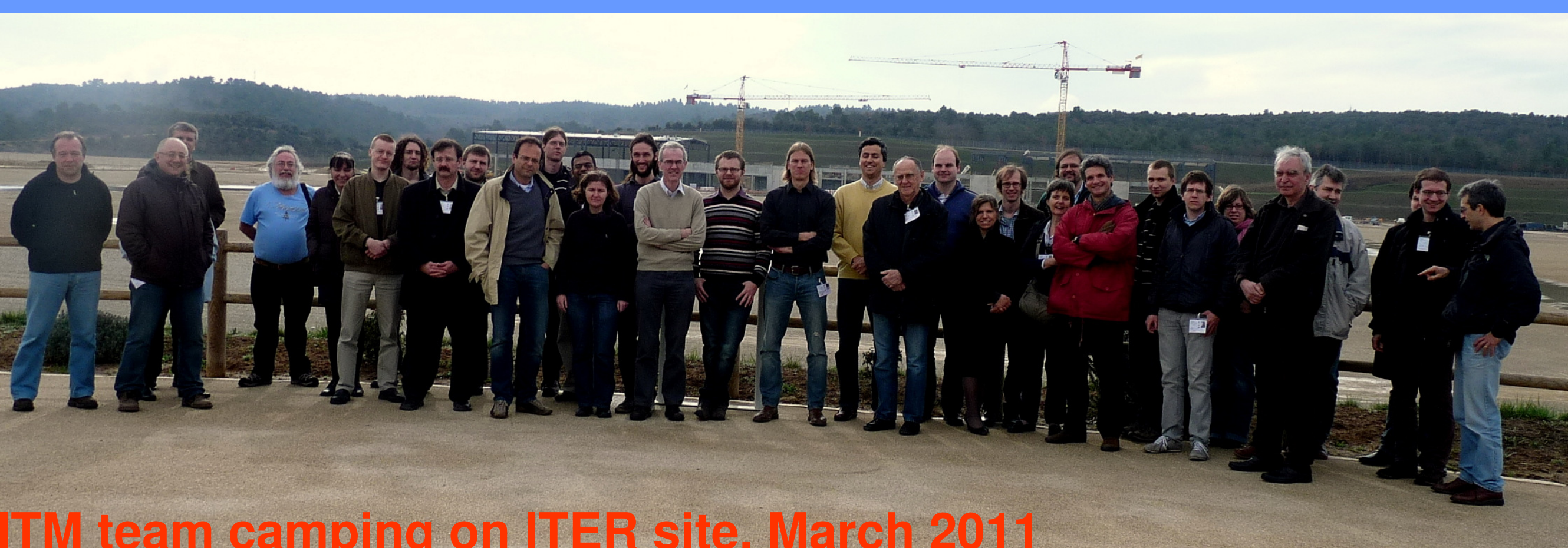
ITM team camping on ITER site, March 2011