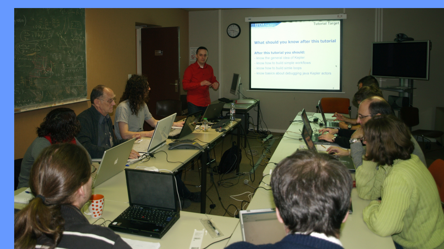
Cadarache, CEA March 2011

Trainings are given by experts on ITM tools, integration of codes into ITM framework and workflows as well as advanced / parallel programming during the ITM General Meeting and Code Camps