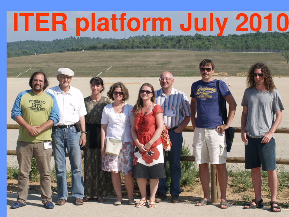
ITER platform July 2010