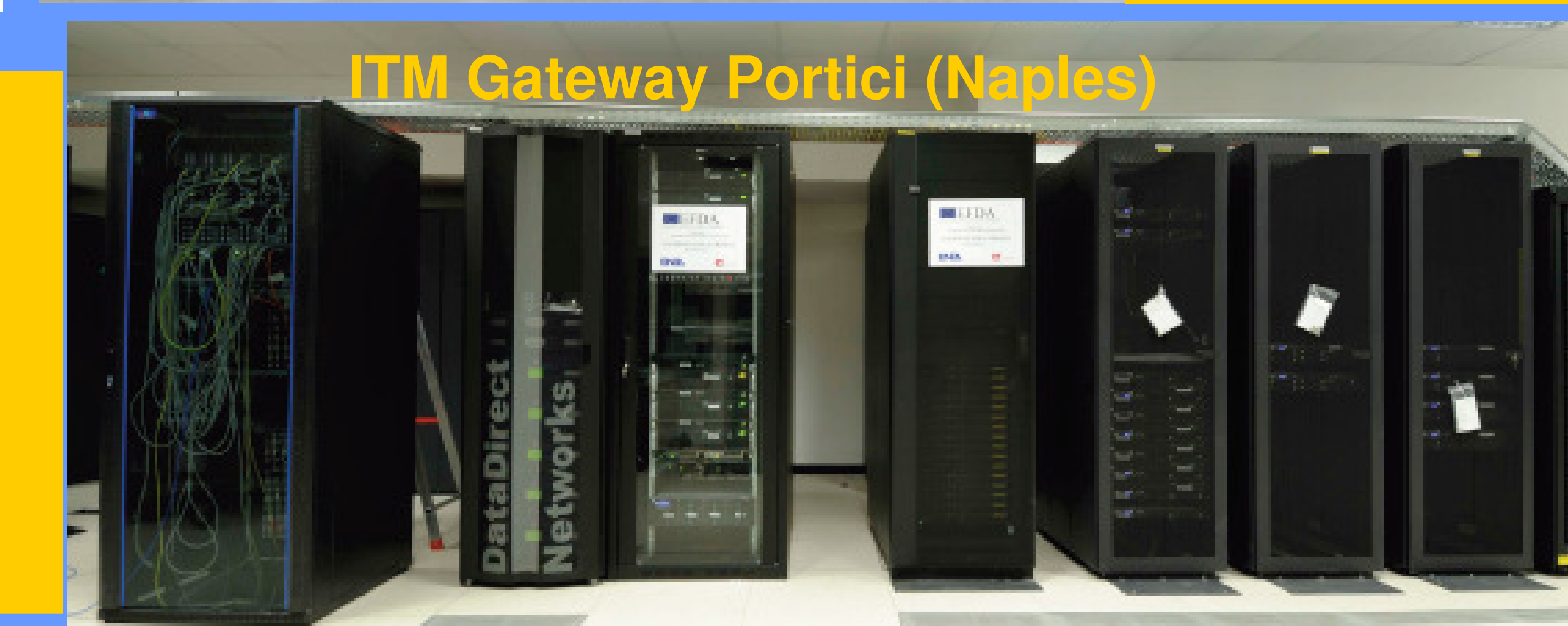
ITM Gateway Portici (Naples)

HPC-FF Jülich (JSC) 100 Tflops/s exclusive for EU fusion since end 2009